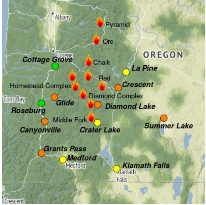
Daily AQI Forecast* for Sunday

Additional smoke outlooks are being issued across Oregon, see https://fire.airnow.gov/ for latest air quality information.