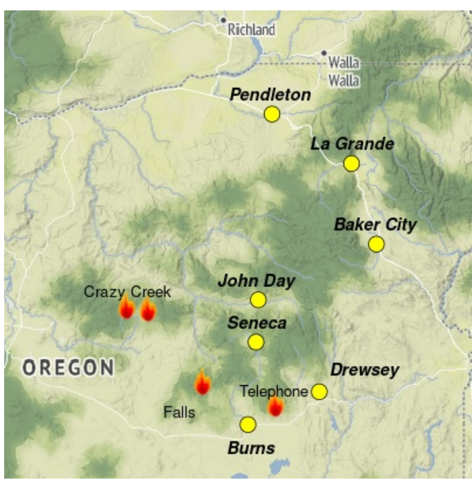
Daily AQI Forecast* for Monday

Smoke Outlooks for adjacent areas are posted on the Fire and Smoke Map .