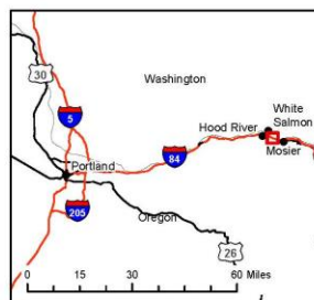
Microwave Tower Closure Exhibit A Closure Number 06-22-01-24-05 Columbia River Gorge National Scenic Area