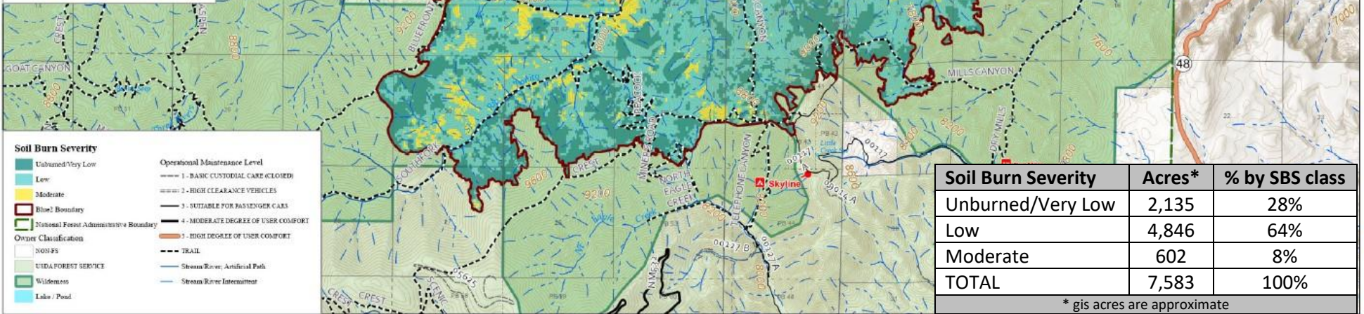
Acres by Soil Burn Severity Class

For additional information including photo examples of soil burn severity see the Field Guide for Mapping Post-Fire Soil Burn Severity at: https://www.fs.usda.gov/rm/leubs/rmrs_rtr243.pdf