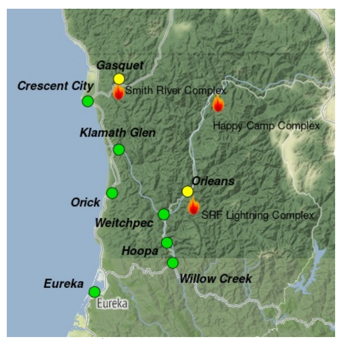
Daily AQI Forecast* for Monday

Heavy smoke is possible on the Salmon River Road.