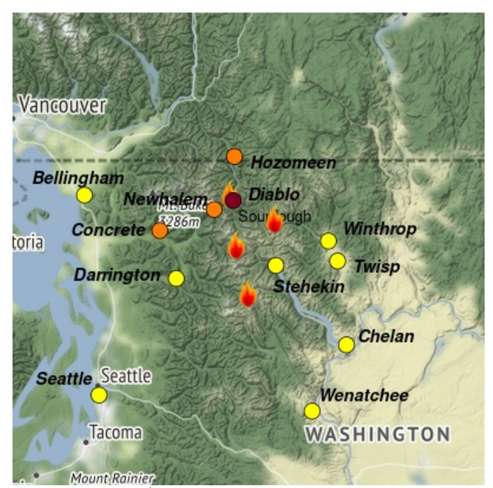
Daily AQI Forecast* for Friday

RED FLAG WARNING remains in effect through today at 5 PM for gusty winds as well as dry and unstable conditions. See NWS Seattle for current conditions in your area.